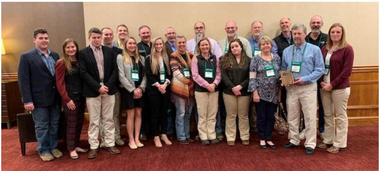
Part of the NC delegation at AFGC.